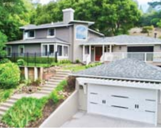
125 Sleepy Hollow Lane, Orinda 6 Bed | 4 Bath $2,470,000 125SleepyHollowLane.com