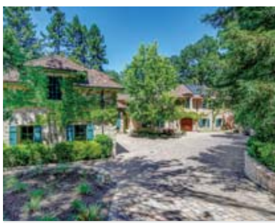
5 Canyon View Drive, Orinda 5+ Bed | 6.5 Bath $3,995,000 5CanyonViewDr.com