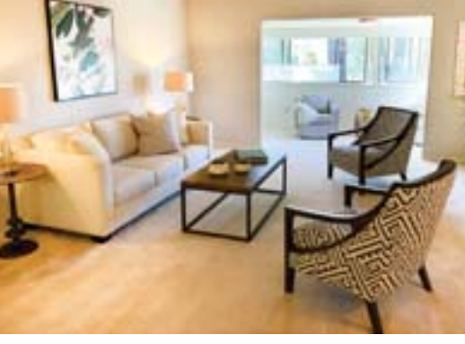
2321 Tice Creek Dr #3, Rossmoor 2 Bed | 1 Bath $397,000 compass.com