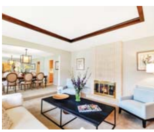
302 Claudia Court, Moraga 5 Bed | 2.5 Bath $1,595,000 302 ClaudiaCt.com